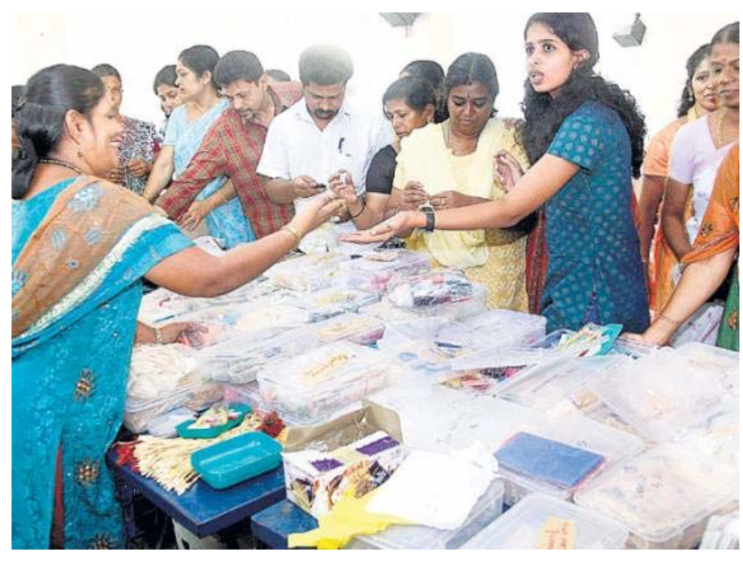
The swadeshi workshop was a hit with people last year

Walk to the boutique next door and a whole range of foreign wear welcomes you.