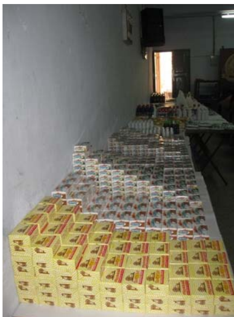
Swadeshi products on display