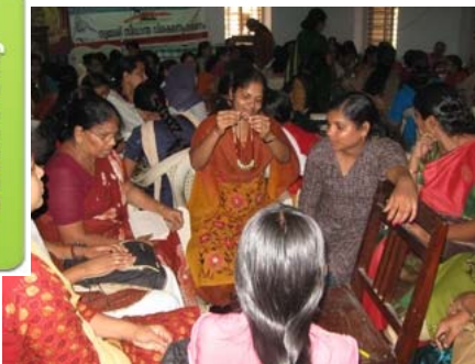
Women during the training session

Dr Radhakrishnan added that there is a sharp decline in productivity and a favour for foreign products, which have a dangerous impact on the nation's growth. There was further need to popularise Swadeshi which will avoid economic dependence on external market forces that could make the village community vulnerable.